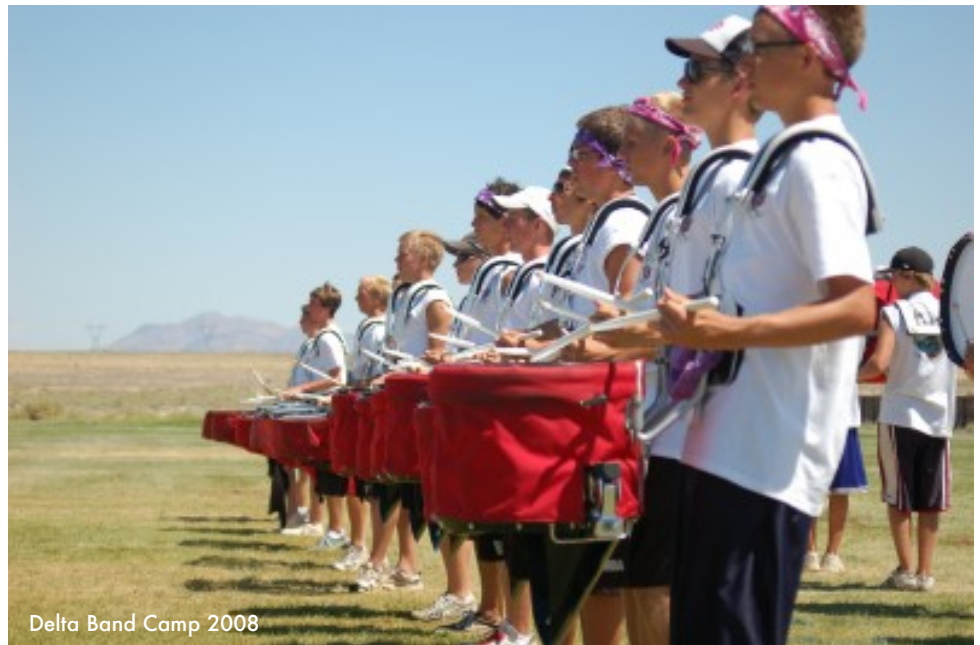
Delta Band Camp 2008